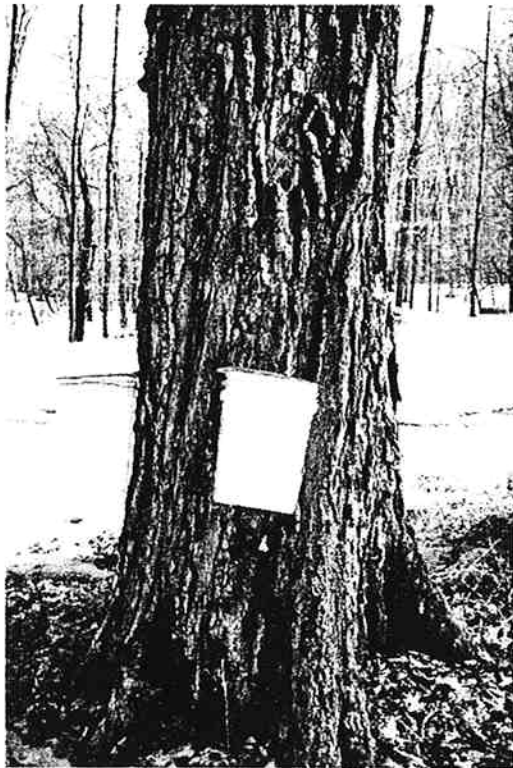
Sugar Maple tree with collection buckets.

Tap holes should heal over by the next season, and new holes are made a short distance away in a spiral pattern to avoid the old holes. The height of the holes is related to the depth of snow cover.