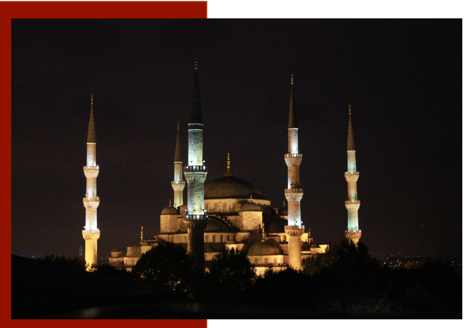
The Blue Mosque, Istanbul, Turkey (2011)