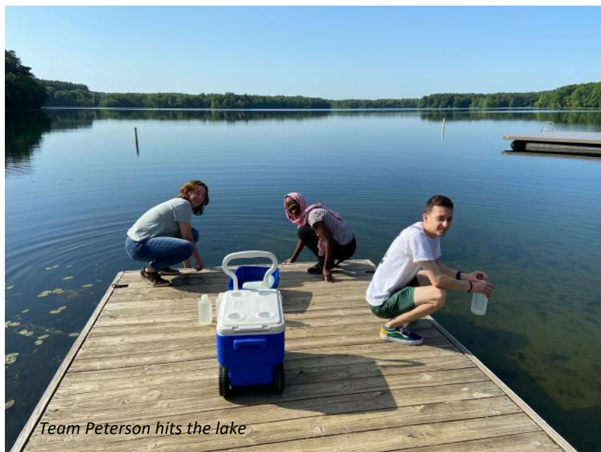
Team Peterson hits the lake

Abdi and Anderson used Lake Sag water to show how natural water matrix affects the lab's rhodium catalytic system as it breaks down fluorinated and chlorinated compounds, including pharmaceuticals. Pena degraded fluorinated agrochemicals using photolysis.