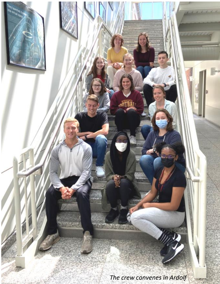
The crew convenes in Ardolf