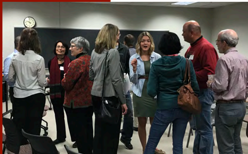
Alumni, faculty and students gather for a panel presentation