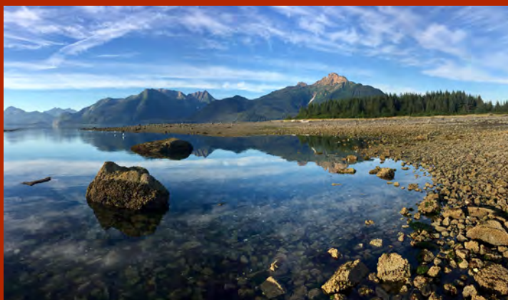
The Beartrack Mountains