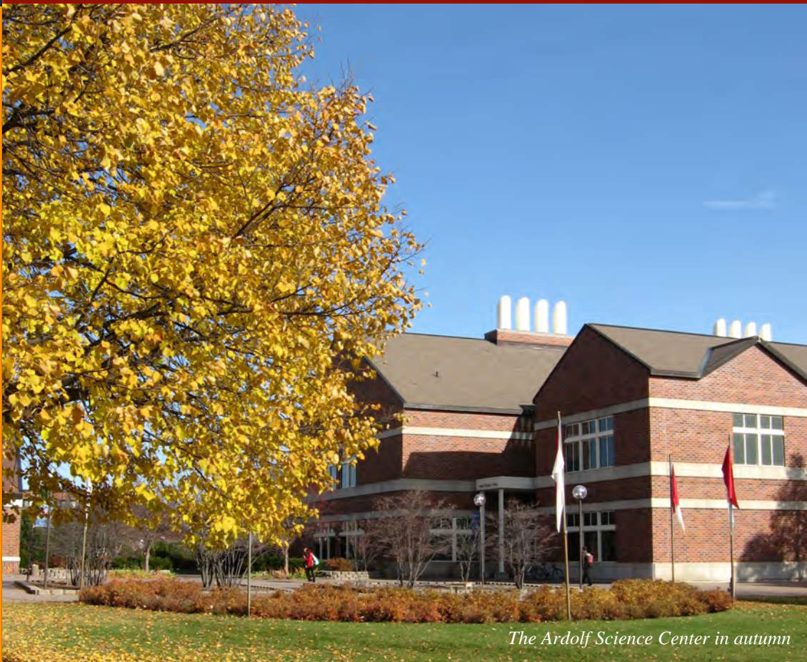
The Ardolf Science Center in autumn