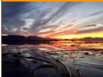
Alaskan Sunset, page 5