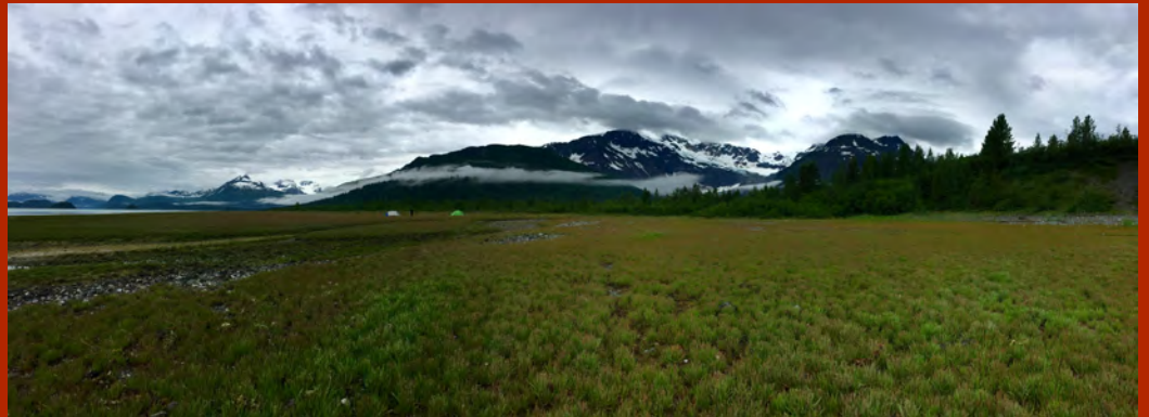
Approaching Scidmore Glacier