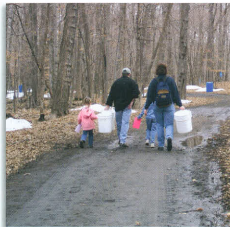
Saint John's Arboretum

■ March came in like . . . maple sap collectors. On March 1 seventy volunteers first invoked a blessing on their work and then spread through Saint John's woods to tap 600+ sugar maple trees to begin Operation Sap-to-Syrup. Metal spigots were inserted in tree trunks and collection pails attached to catch the drip-drip-drip of the sap. We need sunny, warm days and cool nights for a bumper harvest.